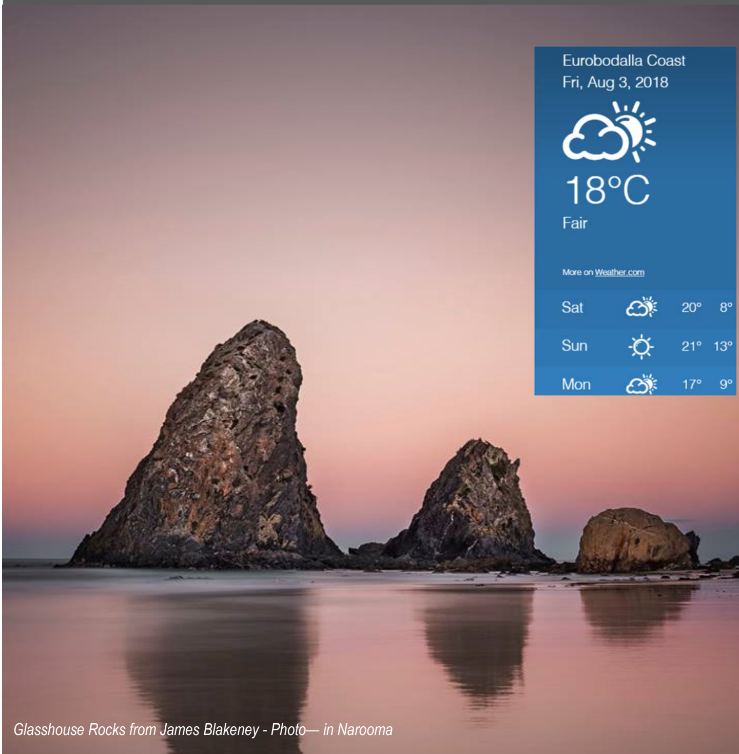
Glasshouse Rocks from James Blakeney - Photo— in Narooma

Your FREE online Eurobodalla weekend magazine.